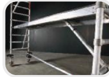
High Clearance Platform